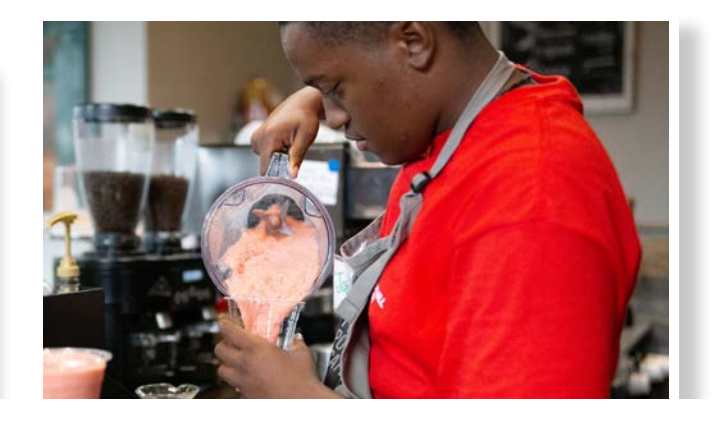
"Our goal here is to make sure people feel at home, they feel safe, they feel secure, they feel comfortable. And they can also get good quality food."