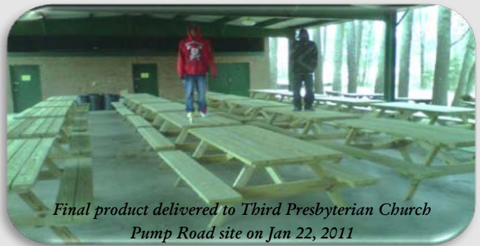
Final product delivered to Third Presbyterian Church Pump Road site on Jan 22, 2011

The workshop has tasked some of the older students with more advanced projects including picnic tables, corn hole sets, and bookshelves. This past September Nehemiah's Workshop received an order for 25 picnic tables from Third Presbyterian Church for the Pump Road site, including both adult and